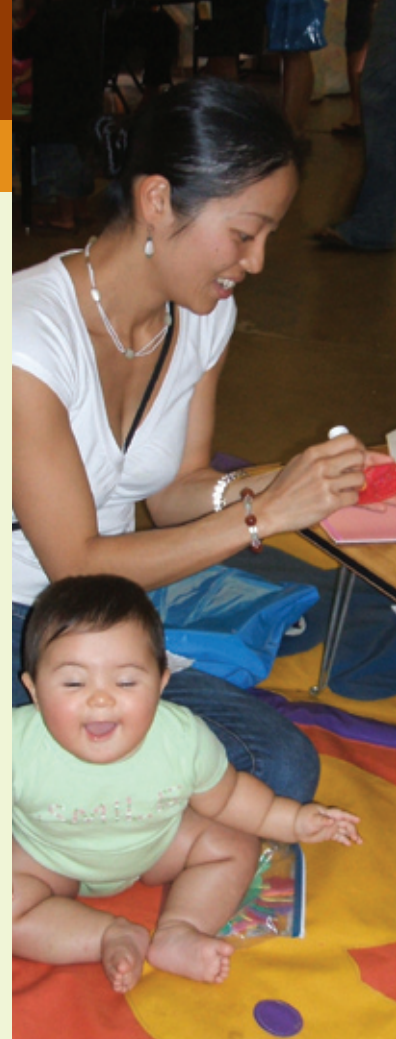
▲ Above: Even Baby enjoys the fair as Mom works on a craft.

We look forward to participating in the Molokai Keiki Expo again next year!