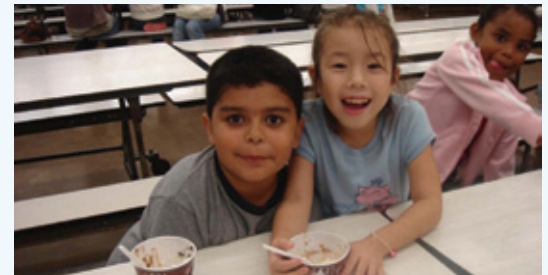
▲ May we have seconds?

participant waiting patiently for his or her turn to make an individually created ice cream sundae. Some went back for seconds, thirds, and even fourths!