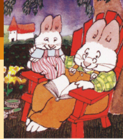
artwork by Rosemary Wells